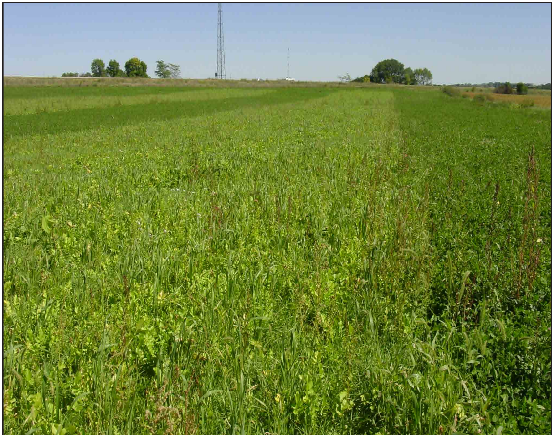
The mix (light green) and red clover growing in strips after cereal rye seed harvest. Photo taken on Sept. 22, 2014.

Dick collected aboveground biomass samples of the green manures in the fall that were dried, weighed and analyzed for C and N concentration at the Soil and Plant Analysis Laboratory at Iowa State University in Ames.