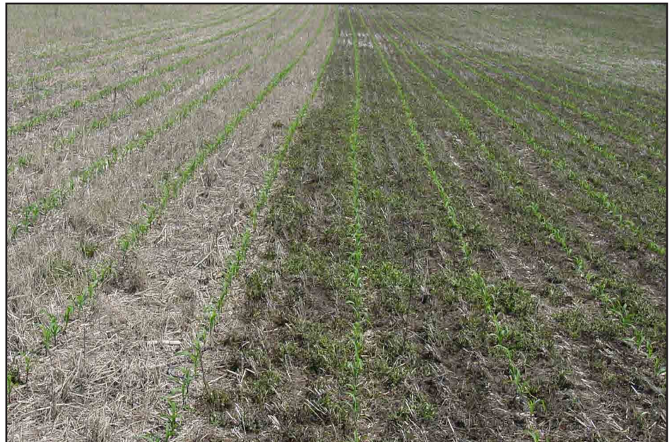
Corn emerges through the mix (L) and the red clover residues on Dick Sloan's farm in May 2015.

Extending crop rotations to include a small grain species such as rye, wheat or oats that are harvested for grain in July, presents farmers with opportunities to try cover crop species that would otherwise not have enough time to establish and grow in typical corn-soybean systems. This tactic also pairs two practices (diversified crop rotation and cover crops) that are