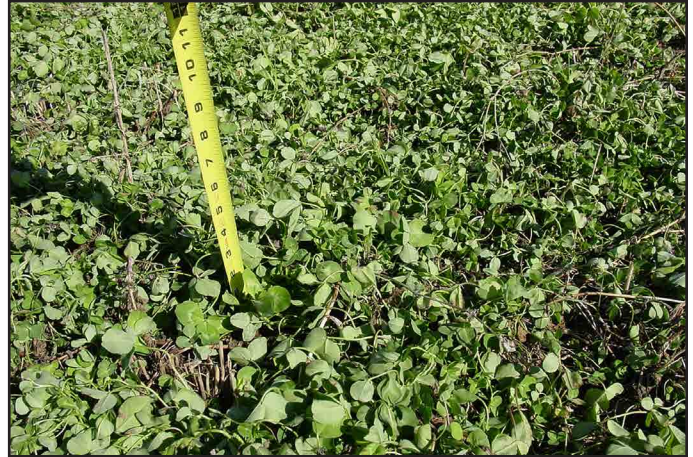
Red clover prior to chemical termination in May at Dick Sloan's farm.

Dick saw very low corn yields when he first tried this in 2013-2014 but admitted that was his first attempt at such a crop rotation, "I can't have beginner's luck with everything I try!" In his second attempt using this system in 2014-2015, Dick realized he had much better luck with frost-seeding medium red clover under a rye crop as compared to seeding mixes in late July or early August. Ever looking ahead and wanting to try new things, though, Dick ponders, "I may experiment with summer-seeded covers each year until I am ready to compare a different mix with clover."