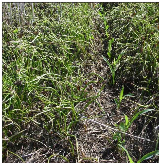
Corn emerging through desiccated red clover in May 2015.