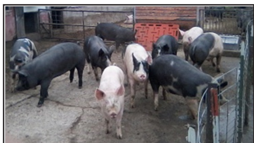
Corn-fed hogs (above) and small grain-fed hogs (below)