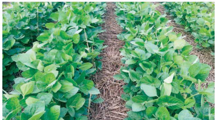
Clockwise from left: Rob Stout speaks to a group of people about cover crops. Dave Bangert (left) stands next to and Rob Stout. An aerial view of Rob Stout's on-farm research showing strips of cover crops next to no-cover strips. Soybeans with cover crop mulch from one of Jack Boyer's trials show how a cover crop can aid weed suppression. Tim Sieren at his farm near Keota.