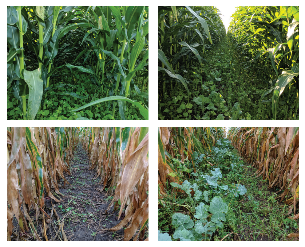
Cover crops interseeded to corn in 30-in. row-widths (left) and 60-in. row-widths (right) at Nathan Anderson's on July 18 (top row) and Sept. 19 (bottom row).

By farm, results that differ by more than the least significant difference (LSD) are followed by different letterrankings and the treatments are considered statistically different at the 95% confidence level.