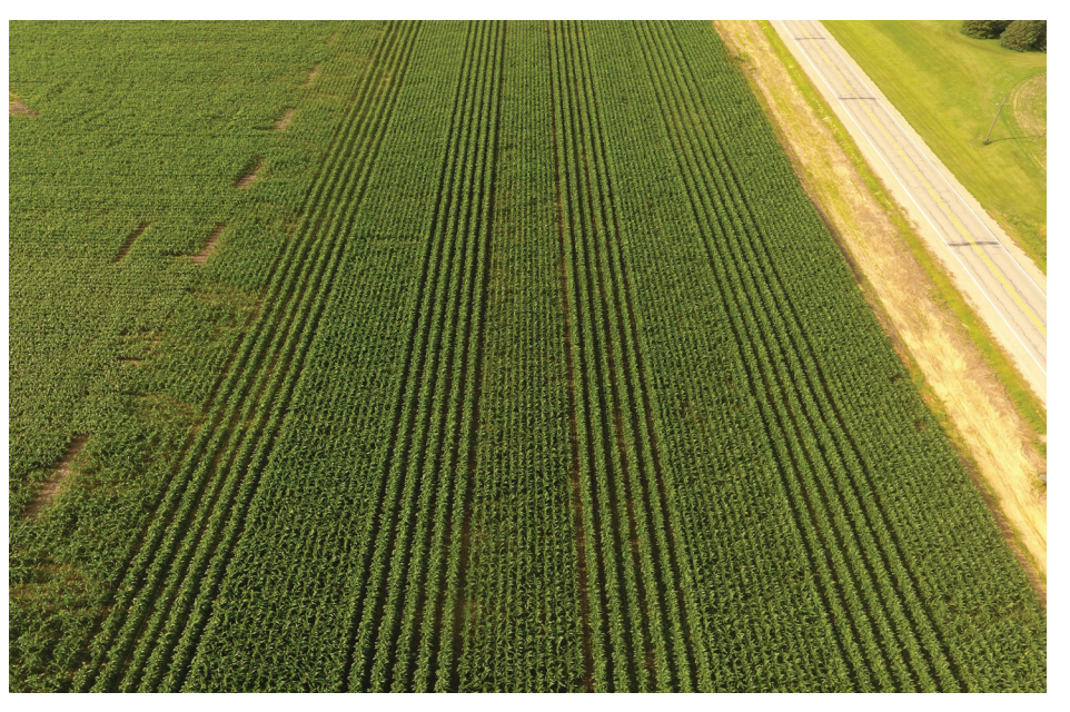
Strips of corn planted in 30- and 60-in. row-widths at Jack Boyer's on July 1, 2019. Corn was planted on Apr. 23 and cover crops were interseeded to corn on June 17.

This report describes the second year of on-farm research trials that investigated the effects of widening the corn rowwidth and interseeding cover crops. Widening the corn row is a version of the solar corridor crop system concept which "is designed for improved crop productivity based on highly efficient use of solar radiation by integrating row crops with drilled or solid seeded crops in broad strips (corridors) that also facilitate establishment of cover crops for yearround soil cover."<sup>[1]</sup> In 2018, two farms saw no difference in corn yields between the 30- and 60-in. row-widths, while two other farms saw yields reduced by 6–30% in the 60-in. row-widths compared to the 30-in. row-width.<sup>[2]</sup> These mixed results were in accord with previous research from the University of Missouri that found equivalent corn yields between 30- and 60-in. row-widths in one year and yields reduced by 14-39% in the 60in. row-widths in two other years.<sup>[3]</sup> On average, the 60-in. row-width resulted in five times as much cover crop biomass as the 30-in. row-width across the farms in 2018.<sup>[2]</sup> The opportunity to grow as much as 4,000 lb/ac of cover crop biomass by the time of corn harvest with 60-in.wide corn rows is particularly appealing