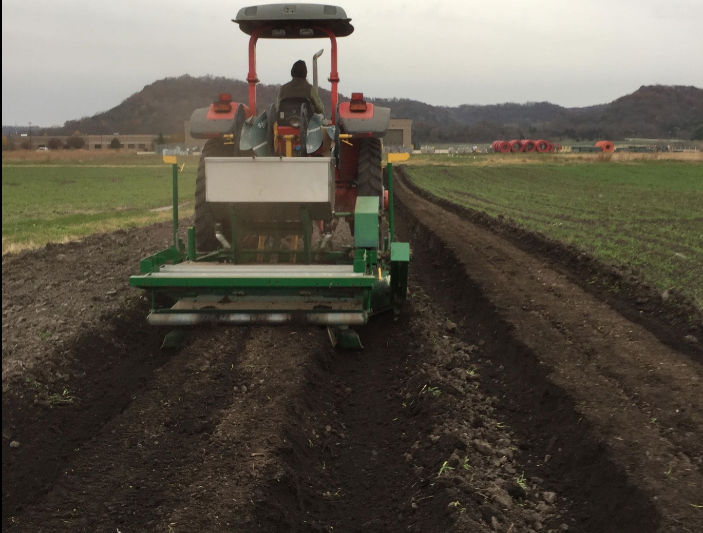
Rain-Flo 2600 Bed Maker