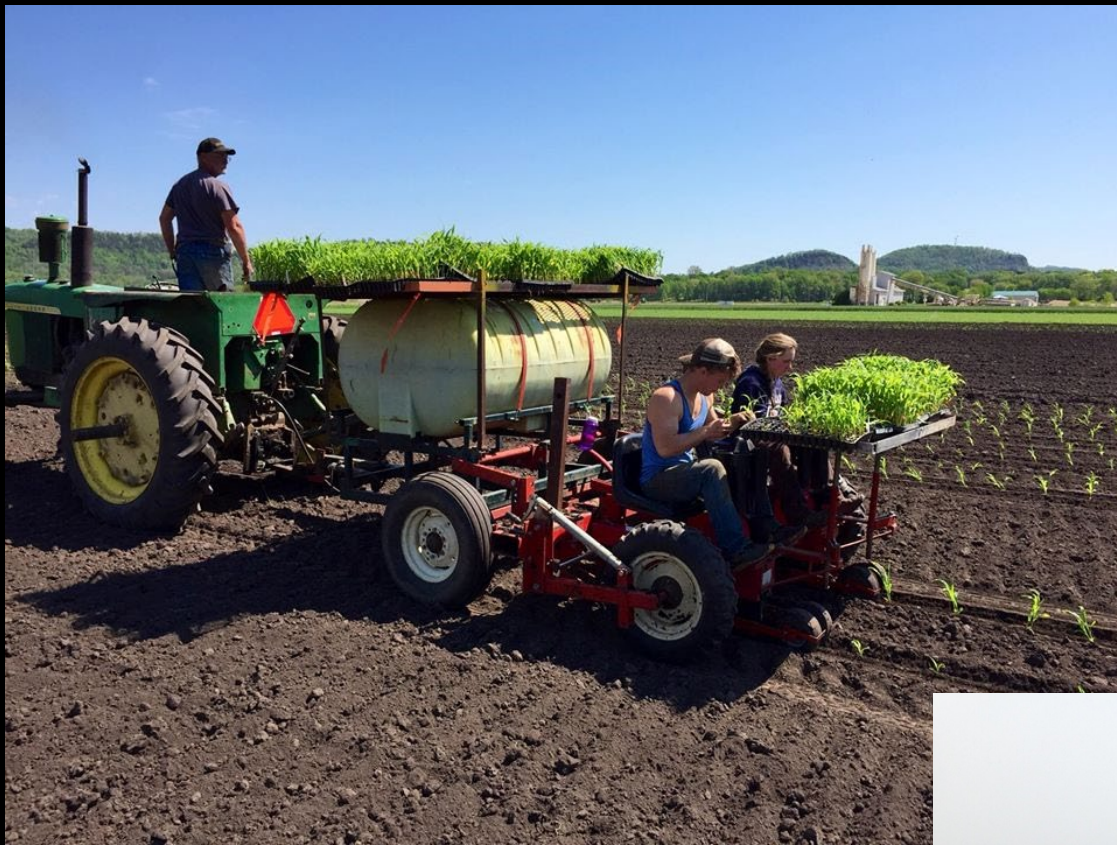
5000 Mechanical Transplanter