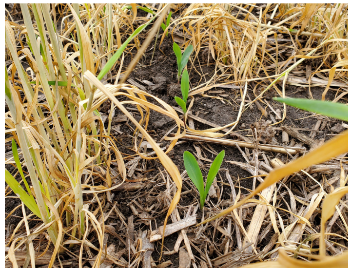
Corn seedlings growing up among cover crop residue at Dick Sloan's on May 18, 2022 (9 days after planting and 7 days after terminating the cover crop).

Corn yield was not affected by seed treatment ( Figure 1 ). In other words, the Humic acid treatment, which did not contain a fungicide or insecticide, produced yields equal to seeds treated with fungicide and insecticide or fungicide only. Across all treatments, the average yield was 214 bu/ac which is just above the five-year average for Buchanan County (209 bu/ac) where Sloan farms. [1]