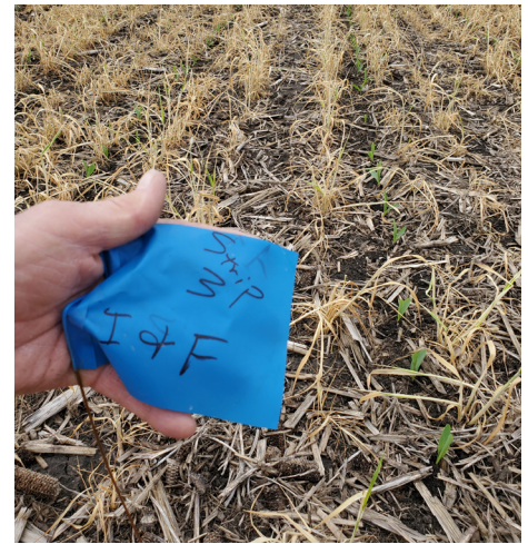
Dick Sloan used labeled and color-coded flags to mark strips in which he planted the three different seed treatment packages. Photos taken May 18, 2022.