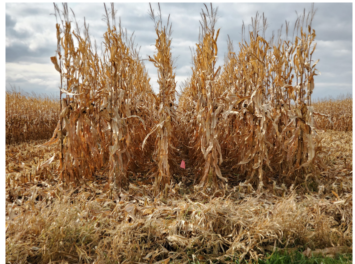
A Fungicide-only strip ready for harvest at Dick Sloan's farm on Oct. 13, 2022.

For each of the three treatments, Sloan planted the same corn hybrid- Viking 48-08. Sloan implemented five replications of the three treatments ( Figure A1 ) in strips measuring 30 ft wide by 1,000 ft long. Field management is presented in Table 1 .