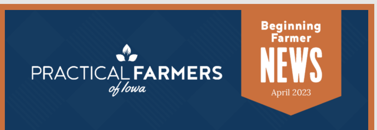
Equipping farmers to build resilient farms and communities.