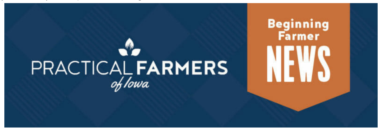
Equipping farmers to build resilient farms and communities.

To:Carly Zierke <carly.zierke@practicalfarmers.org>