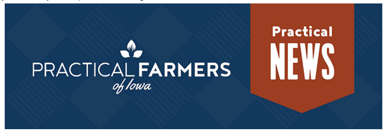
January 15, 2024

To:Carly Zierke <carly.zierke@practicalfarmers.org>