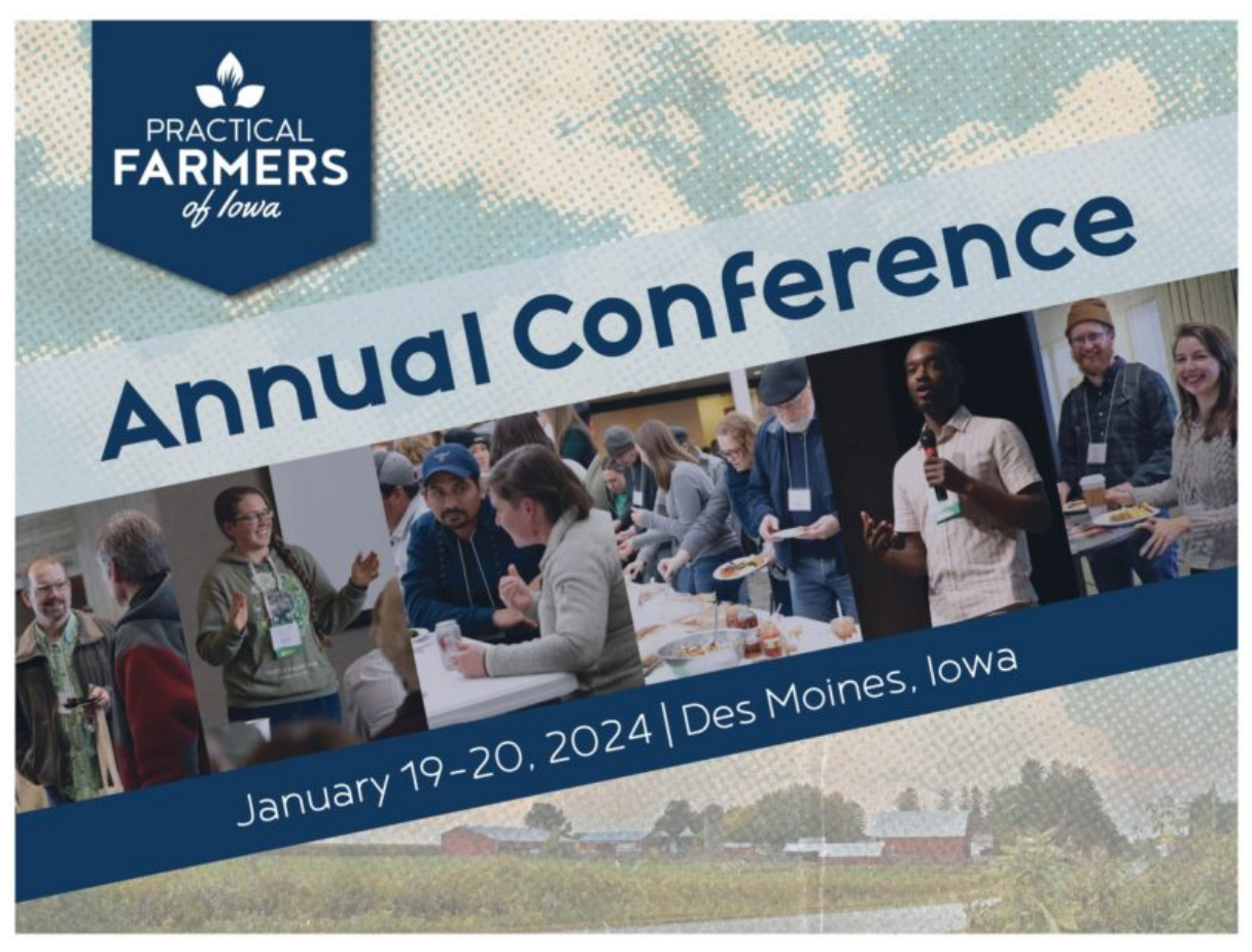
See you this weekend in Des Moines! Walk-in registration available

Equipping farmers to build resilient farms and communities.