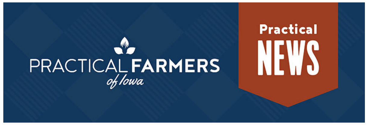
February 19, 2024

To:Carly Zierke <carly.zierke@practicalfarmers.org>