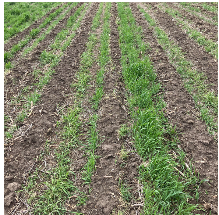
Tim Sieren's strip-tilled treatment. Photo taken April 19, 2023.

Keaton Krueger and Tim Sieren both use strip tillage to prepare cover cropped fields for soybean and/or corn planting. However, they recognize that removing the strip-till pass in favor of no-till planting would further reduce their planting input costs and time commitments. They both think no tillage would be preferable on their operations if there is no large negative yield impact. Sieren stated that “If I can obtain similar yields [using no-till] as strip-till, I can return to 100% no-till on my corn acres, reducing time, fuel, and machinery costs. I hope to increase no-till acres.” These cooperators designed a trial to test how strip-till vs. no-till planting soybeans (Krueger) or corn (Sieren) affected their crop yields. Sieren participated in a similar PFI Cooperators trial in 2019 where he found that strip tillage resulted in greater corn yields (by