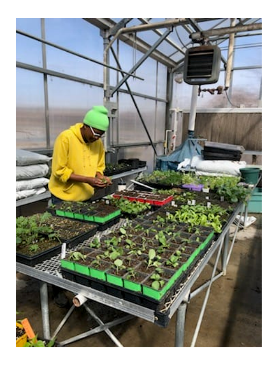
Equipping farmers to build resilient farms and communities.