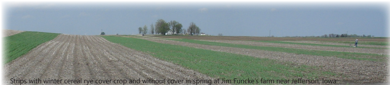
Strips with winter cereal rye cover crop and without cover in spring at Jim Funcke's farm near Jefferson, Iowa.

without cover at Clutier 1 in 2011 ( r = 0.85 ; P = 0.0074 ), New Market in 2011 ( r = 0.94 ; P = 0.0053 ), and Clutier 1 in 2013 ( r = 0.74 ; P = 0.0932 ). Soybean yield was negatively correlated to cover crop biomass across strips with cover and without cover at West Chester in 2011 ( r = -0.83 ; P = 0.0786 ) and Coon Rapids in 2013 ( r = -0.80 ; P = 0.0563 ).