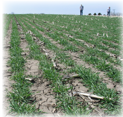
Winter cereal rye cover crop at Rick Juchems's farm near Plainfield, Iowa.

At one site-year, Clutier 1 in 2011, non-GMO soybeans following a cover crop