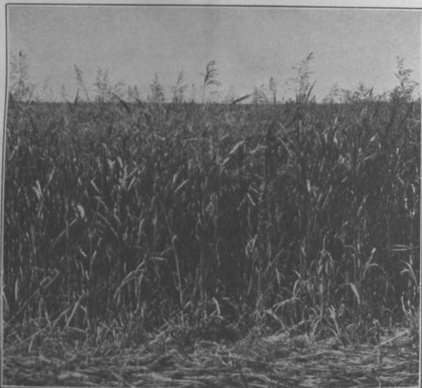
FIGURE 3.—A heavy growth of Sudan grass.

Alfalfa and sweetclover likewise have a common inoculating organism but, unlike the previous group, often need artificial inoculation when being grown for the first time. This is especially true in the eastern half of the United States.