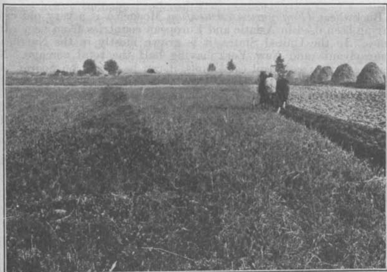
FIGURE 5.—Crimson clover and grain stubble being turned under for soil improvement.

The use of legumes in rotation as one of the regular cash crops is a common practice and one of the most economical ways of maintaining soil fertility and crop production. The stubble of the legume returns to the soil considerable organic matter that is high in nitrogen and that costs practically nothing (fig. 5).