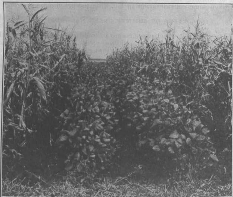
FIGURE 4.—Corn interplanted with soybeans.

In northern latitudes there is relatively little leaching during the winter period; consequently it is seldom profitable to grow a crop merely to prevent this relatively small loss. In the case of abandoned or worn-out lands a legume might well be sown to occupy the land more or less permanently, and where seed of a satisfactory