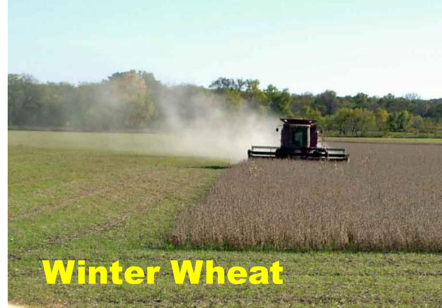
2010 1 st time aerial seeding with plane