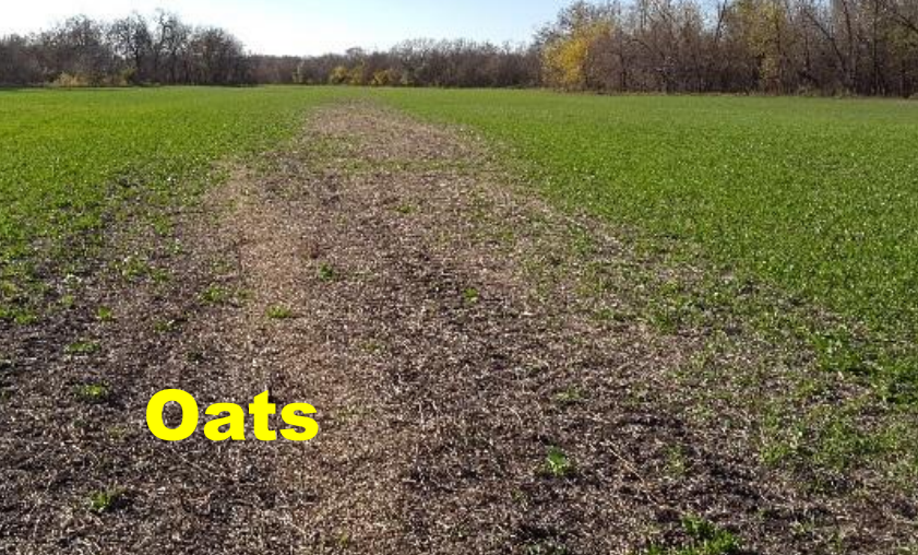
2008 1 st try over-seeding with 3- point broadcaster